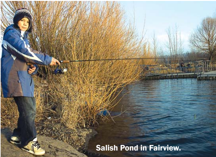
Salish Pond in Fairview.

Confluence of the Willamette and Clackamas rivers. Boat ramp. Extensive bank angling. Picnic area. Located off Hwy. 99E at the north end of Oregon City. Easy access from I-205 and 99E. City park.